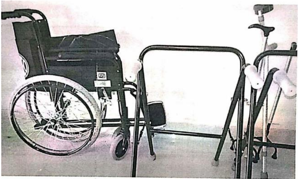
Wheel chairs and walking sticks and elbow sticks were kept ready to distribute among the differently-abled students of PVKN Govt College, Chittoor.