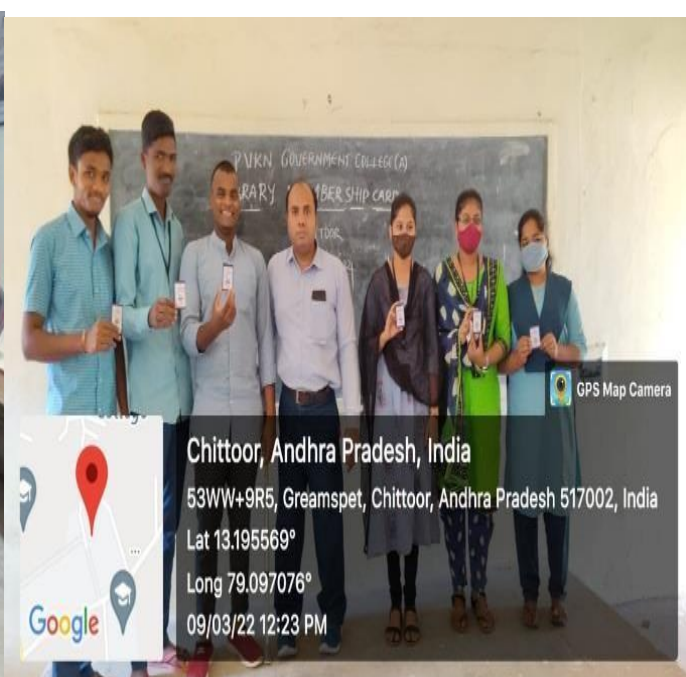
Students with Central Library Membership Card