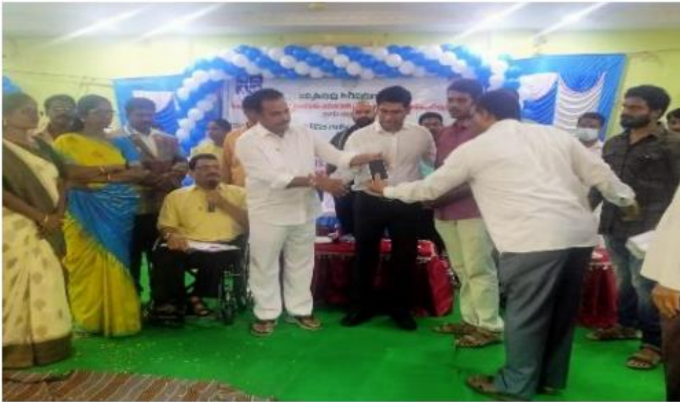
Getting Laptop and Mobile Phones from the Govt. of AP on the Occasion of World Disabled Day