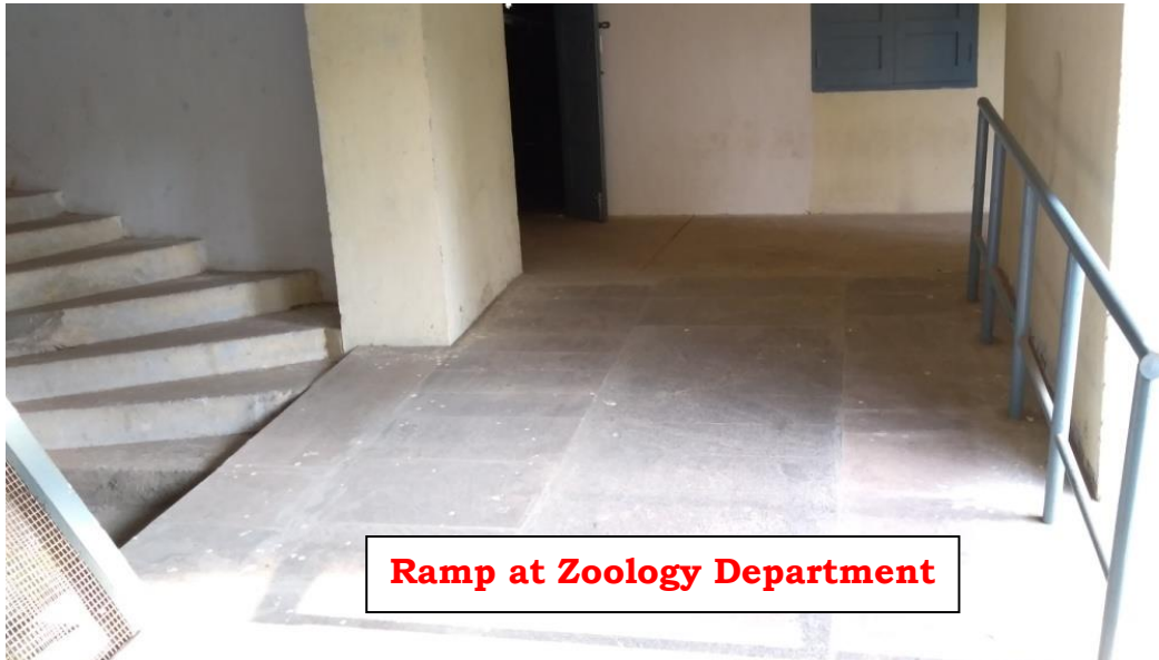
Ramp at Zoology Department