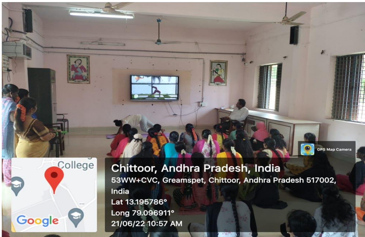
Demonstration of Surya namaskar's by Smt.Hemalatha (Student of diploma in Yoga PVKN)