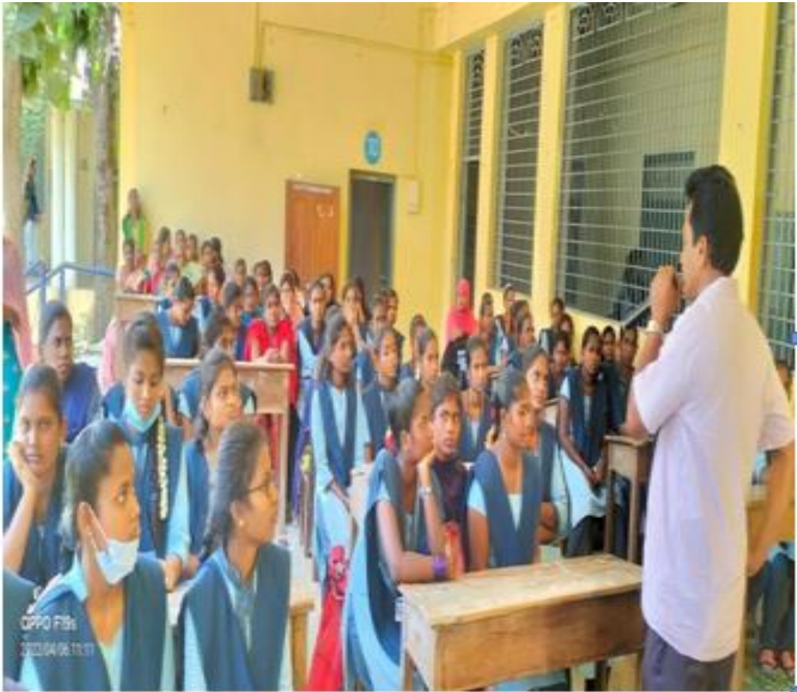
Disha app importance explained by Disha team and Principal, P.V.K.N.GOV(TA), Chittoor.