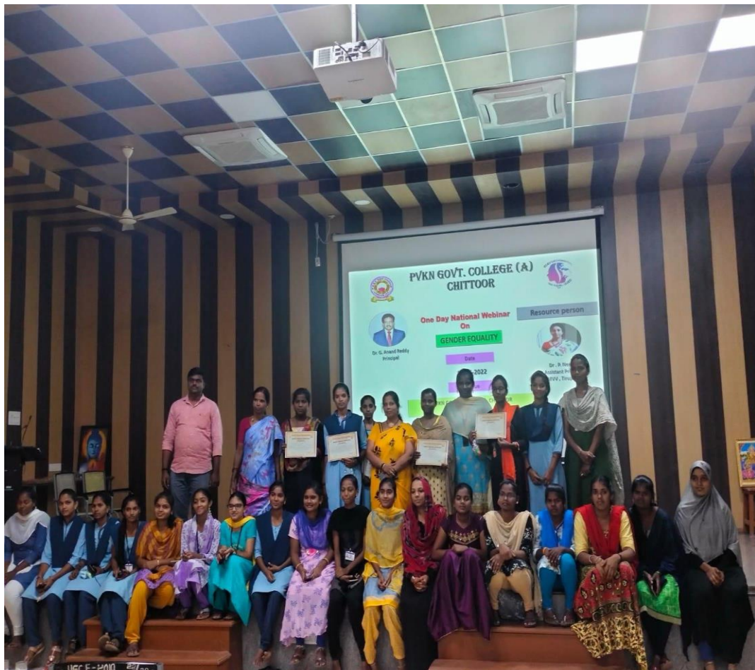
Certificates distributed for the Students Participated in Kahoot Quiz on Famous Women Personalities