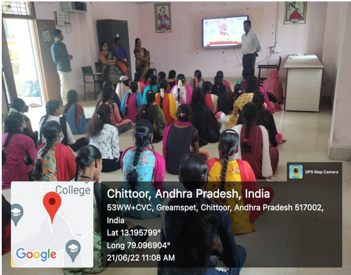
Yoga activity performed by the women participants